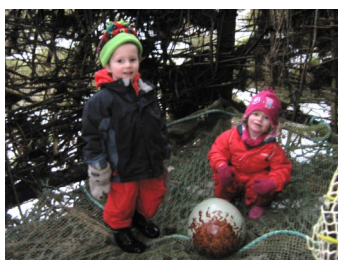
Getting the egg back to the nest

Get in touch with your news and views phone 01571 844368 email info@culagwoods.org.uk