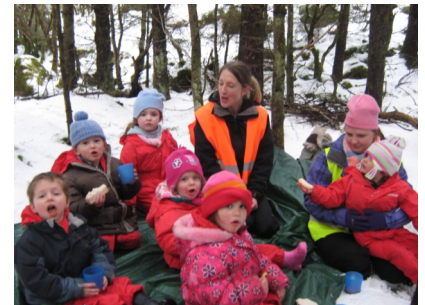
Everybody say "Hot Soup!" The children enjoying a warming cup of soup at snack time.

We've had fun all day playing in our woods We've had fun all day playing in our woods We've had fun all day being, laughing, learning and playing We've had fun all day playing in our woods