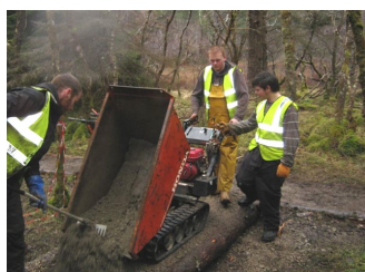
Constructing the path

As part of a continuing partnership between Ullapool High School & CCWT ten Rural Skills pupils came to Culag Woods