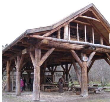
The log barn at Milton Community Woodland used as a workshop for projects

CWA's employability services project aims to bring together community woodland groups to discuss and share ideas to help develop social enterprise through training and employability projects. The project will run until Summer 2012 and has a full time Social Enterprise Development Officer. The community groups involved are Dunnet Forestry Trust, Abriachan Forest Trust, Milton Community Woodland